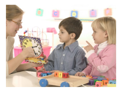
Student Safety is a Priority in the Paola schools.

If an emergency or disaster situation ever arises while your student is in school, we want you to be aware that our schools have made preparations to respond effectively.